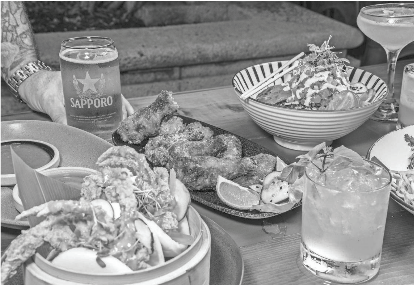
An array of dishes and drinks at the newly expanded Kapow Noodle Bar in Boca Raton.

them differently so that the flavors really pop.”