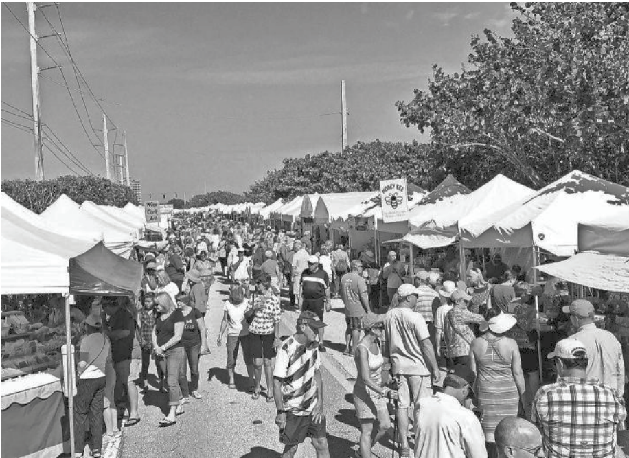
Explore the works of more than 125 craft artisans this weekend at the 20th Annual Juno Beach Craft Festival at Loggerhead Marinelife Center.

Enjoy a dazzling array of arts and cultural events this autumn in the Palm Beaches! Here to help you with three ideas for the coming week is the Cultural Council for Palm Beach County, the official support agency for arts and culture here in Florida’s Cultural Capital. For more to enjoy and experience, explore the Council’s online events calendar at palmbeachculture.com/events . Visit each organization’s website for COVID-19 safety protocols and guidelines.