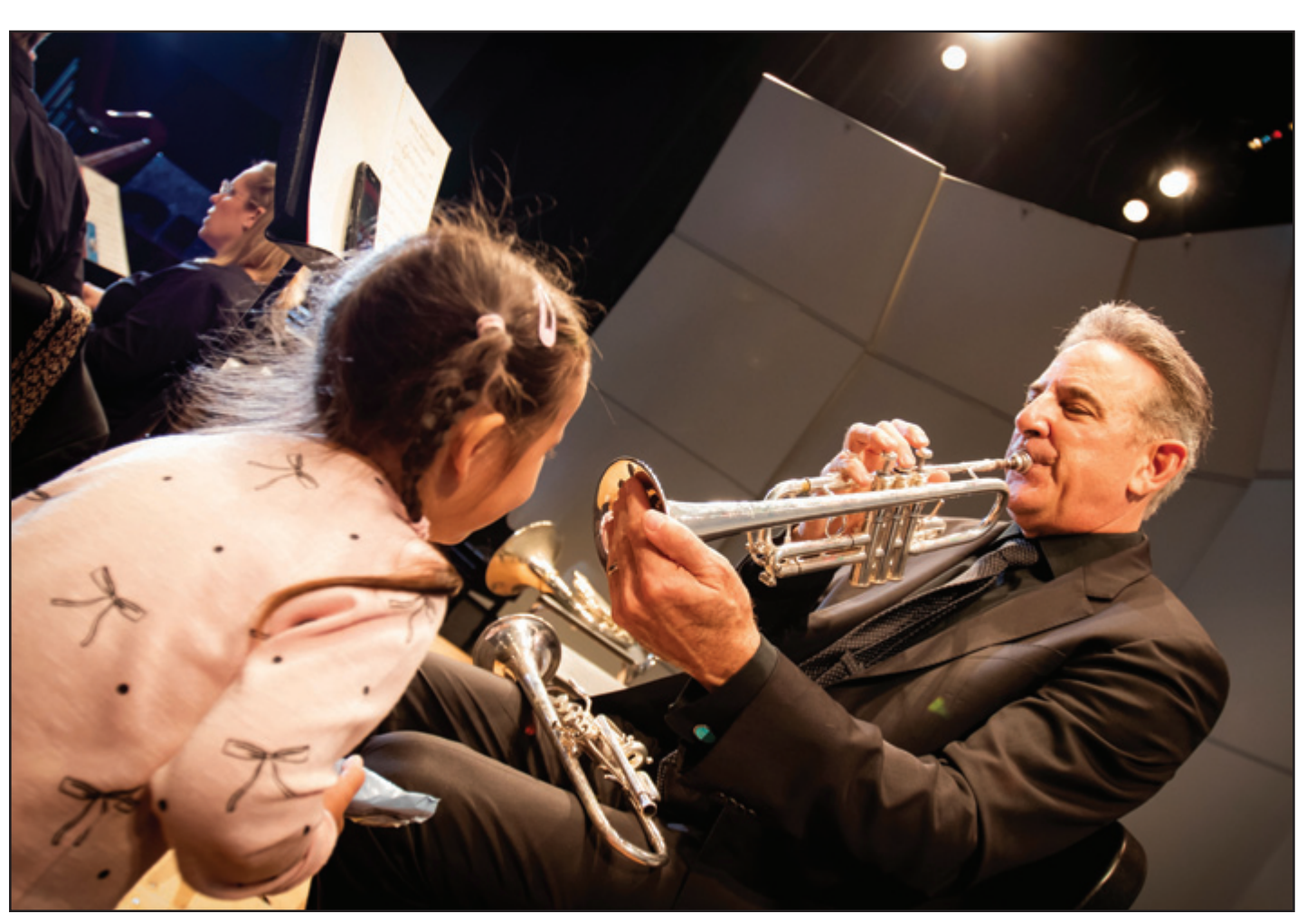
Children can see the workings of an orchestra during The Symphonia's Meet the Orchestra events held during rehearsals this season in Boca

For additional information on Meet the Orchestra or for season tickets, flex passes, or individual tickets, visit www. thesymphonia.org, or call 561-376-3848. ■